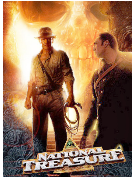
It almost doesn't matter anymore which franchise gets their poster used for new films. They're basically the same...

premiere day, the number of days in a year." Coincidence? They leave that to you to decide.